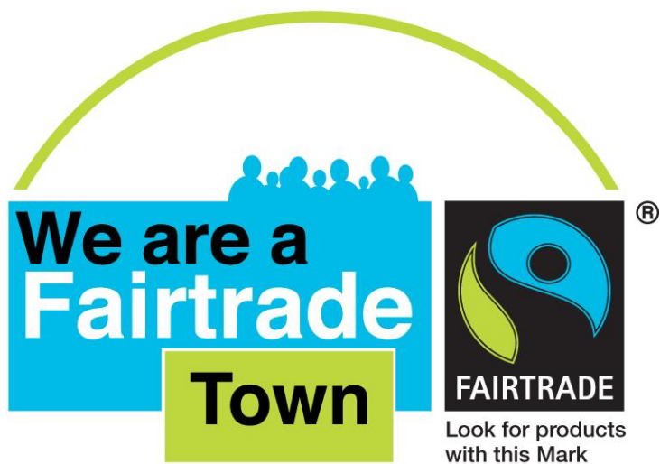
Sticker given to FT shops ↓