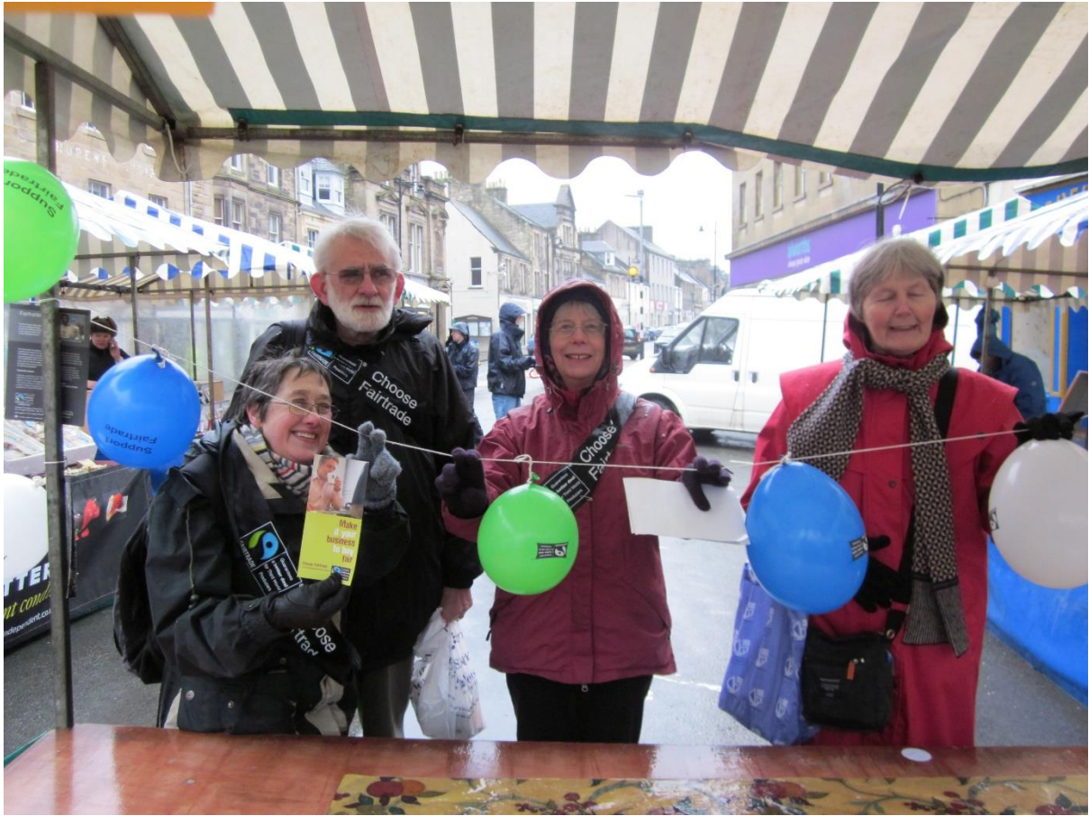
Stall in Co-op ↓