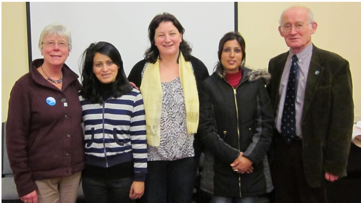
↓ Nepalese visitors