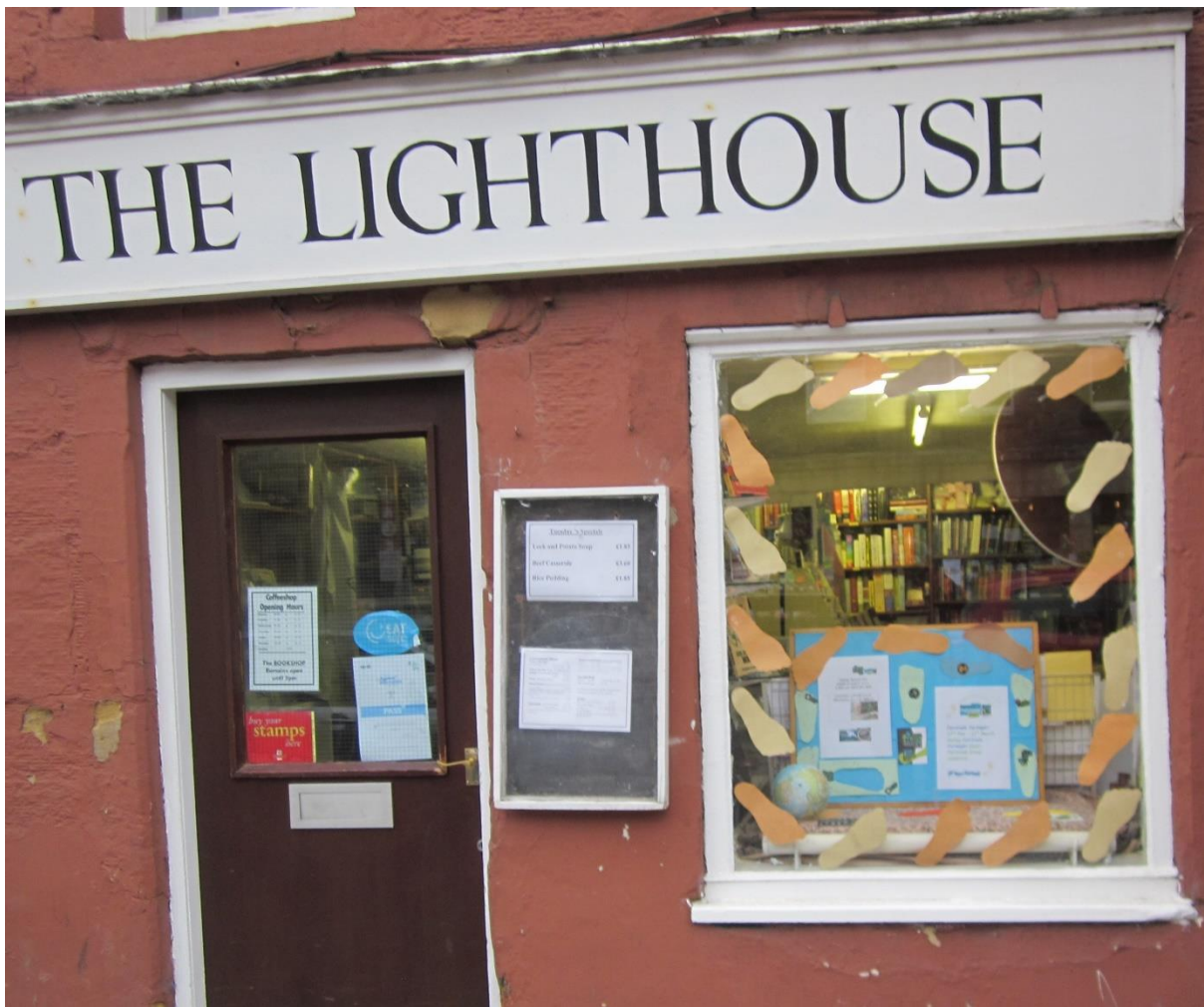
FT Fortnight : Lighthouse window suitably dressed ↑