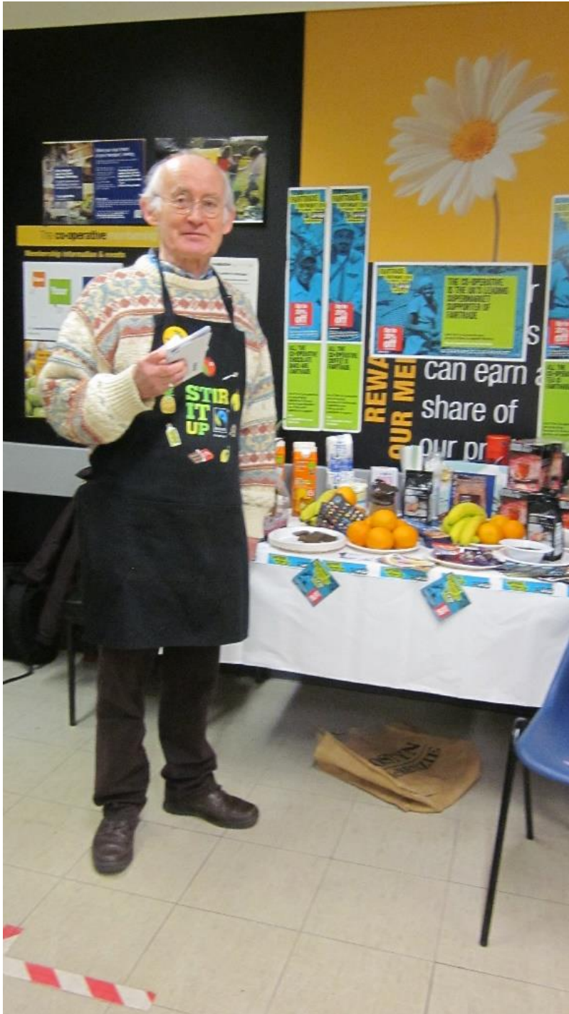
←stall at Co-op