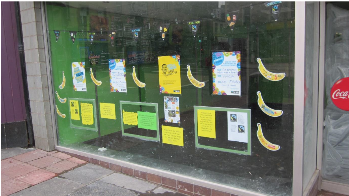
FT banana splits at Kilmarnon Special School ↓